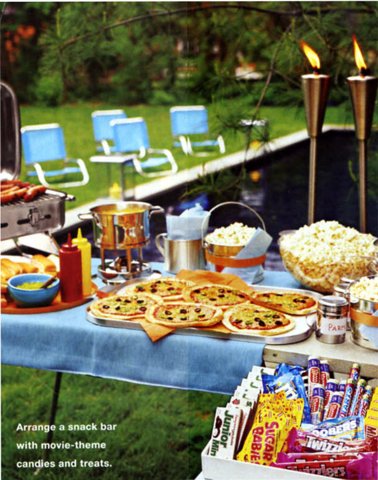
Arrange a snack bar with movie-theme candies and treats.